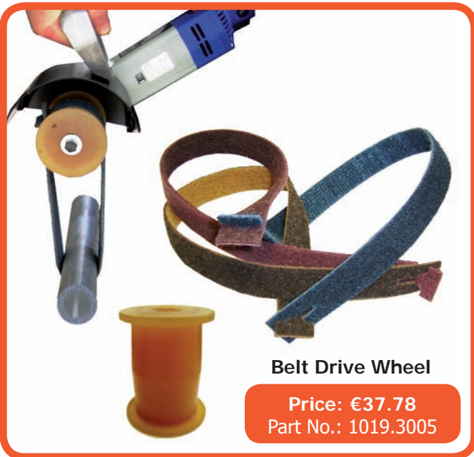
Belt Drive Wheel

Removal of light to heavy scratches and at some time application of a satin sheen.